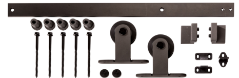
9457-72 & 9457-96 3" Face Mount